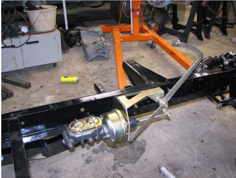
Power Brake booster