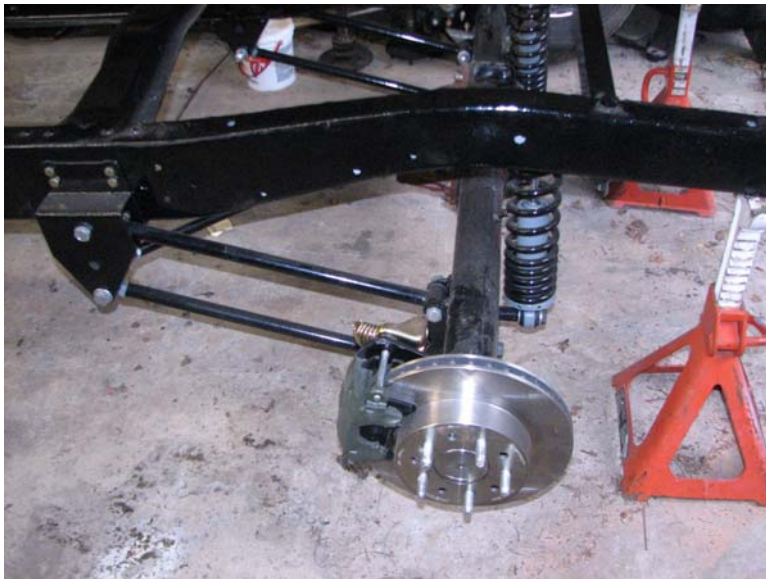
Rear disk brakes