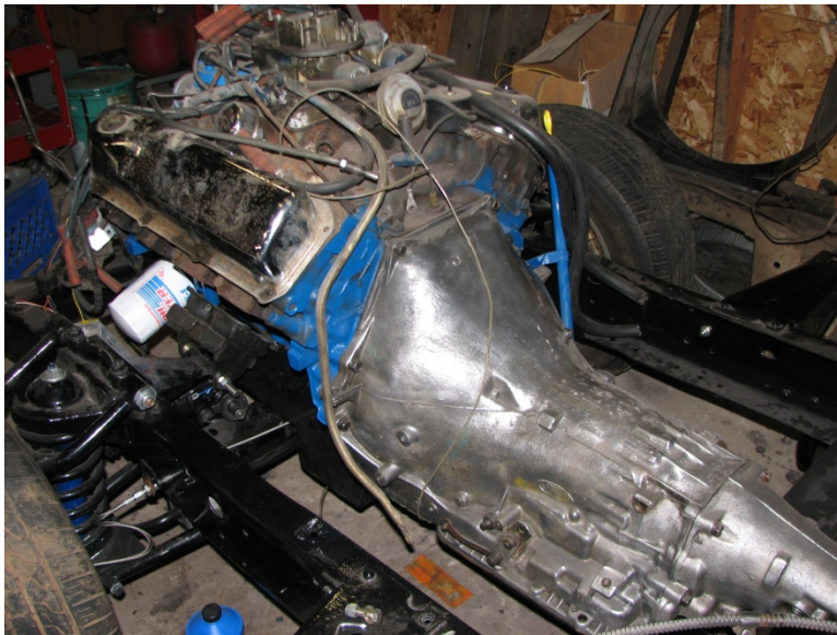
351 M with C6 transmission